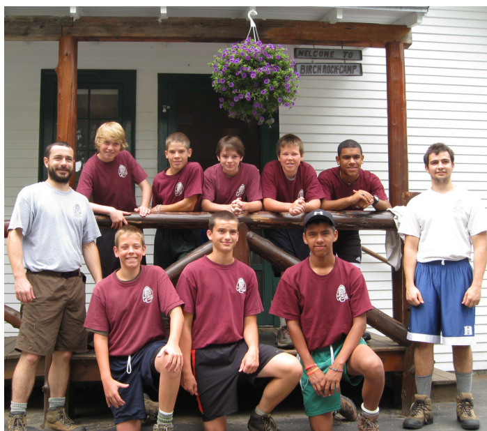
Maine Wilderness Adventurers 2010

For more information: www.birchrock.org or 207-741-2930